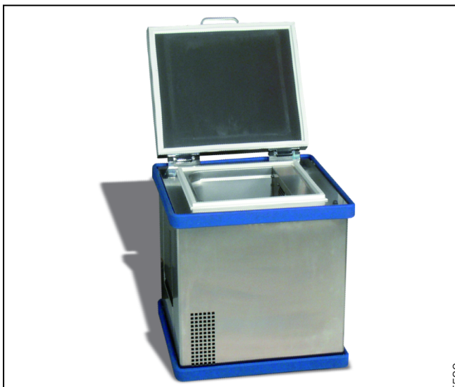
Specimen cooling box