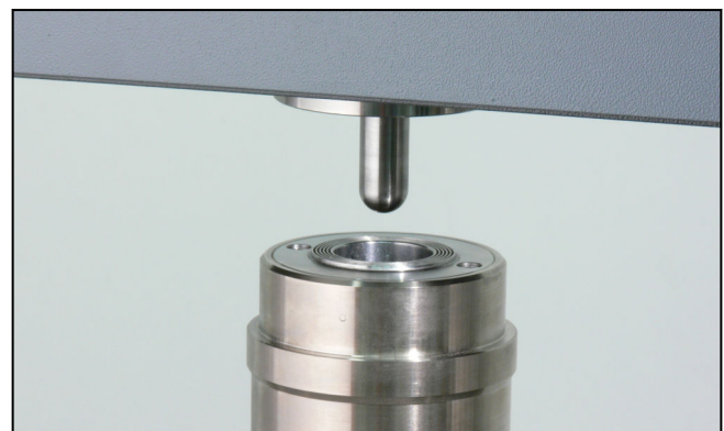
Impactor with clamping ring

Depending on the diameter of the impactor, a pair of clamping rings has to be selected, which includes a support ring (bottom) and a clamping ring (top). A specimen is securely gripped between the two clamping rings with use of the drop weight tester's pneumatic clamping mechanism. Depending on the test standard or the inner diameter of the clamping rings, a corresponding mounting is selected. The mounting has a solid structure to minimize deformation of the specimen support, whereby reliable test results are achieved. In addition, the mounting collects the specimen remains in the inner free space. The mounting also provides a fixture for unclamped testing.