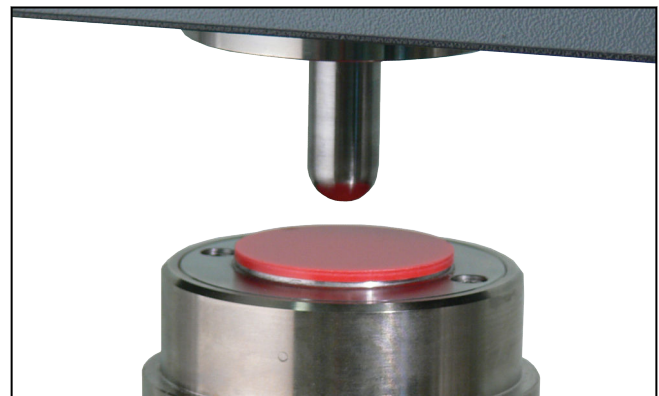
Impact body with sample

impactor is instrumented with a Piezoelectric sensor. It is used to measure the force and calculate the deformation of the specimen (travel). A separate travel measurement is not necessary. The impactor is selected according to standard or the expected maximum force, and must always be combined with the corresponding clamping ring. All impactors are manufactured with hardened steel.