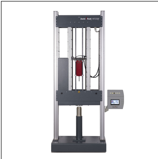
Amsler HIT230F, multiaxial puncture test